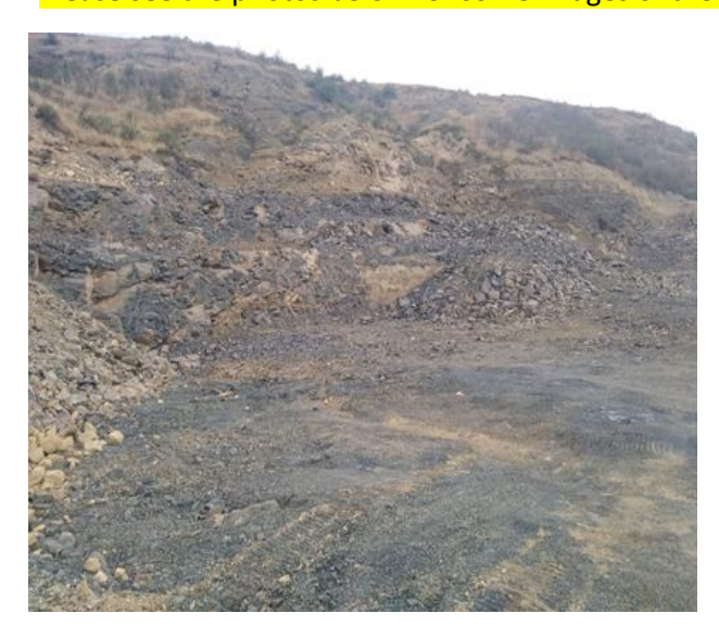
Please see the photos below for some images of the roads condition and the borrow pit.